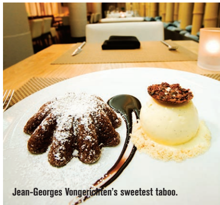
Jean-Georges Vongerichten's sweetest taboo.

WHERE TO SIP AND SUP After a long day of patriotism, perhaps your first post-convention cocktail should be at the Red, White and F*cking Blue Bar (yes, that's really the name, minus the star). Located in The Chambers Hotel ( www.chambersminneapolis.com ), you can down a much-deserved drink and then head to the hotel's restaurant, celeb chef Jean-Georges Vongerichten's Chambers Kitchen . Some of the best restaurants are located on Loring Park, just a short walk from the convention center. Both Nick & Eddie ( www.nickandeddie.com ) and Café Lurcat ( www.cafelurcat.com ) offer a bustling bar scene. Or soak up the scene from the brand new W Hotel's Prohibition ( www.whoels.com ) a 27th-floor bar with sweeping views of the city. ■