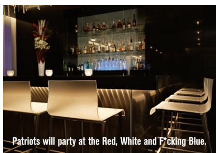
Patriots will party at the Red, White and F*cking Blue.