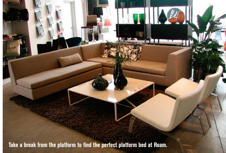
Take a break from the platform to find the perfect platform bed at Roam.

One of the hottest tickets in town, will be The Daily Show . Jon Stewart and his "Best F*cking News Team Ever!" will broadcast live from both conventions. Catch them in Denver at the University of Denver's Byron Theatre and