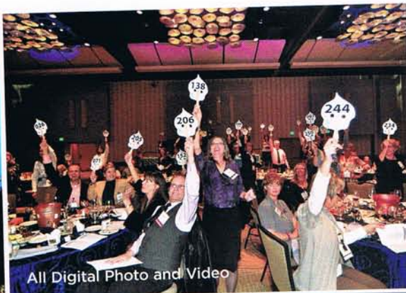
All Digital Photo and Video